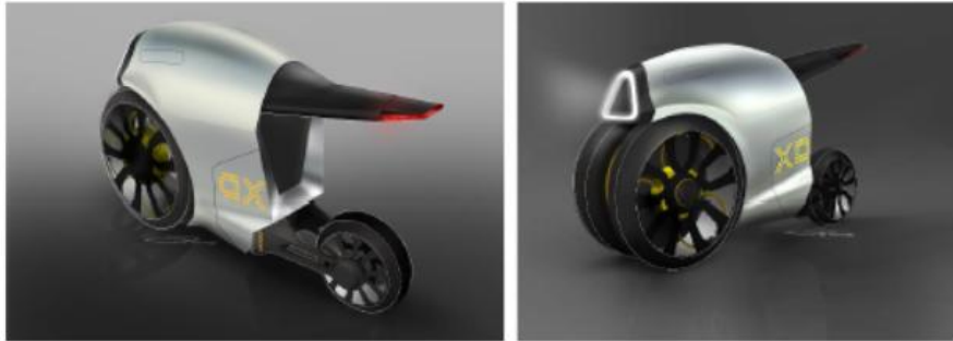
XD - PROPOSAL 1